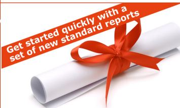
ForNAV Standard Reports